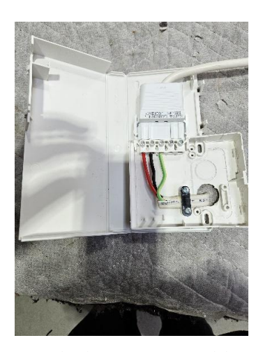
Splash cover assembly