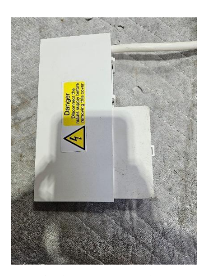
Splash cover complete