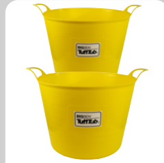
LH-2930 / LH-2931