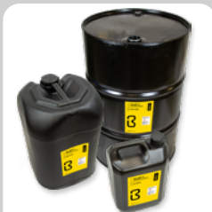
YE-1859-5 / YE-1859-25 / YE-1859-210