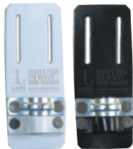
LE-2151 / LE-2150