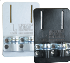
LE-2161 / LE-2160