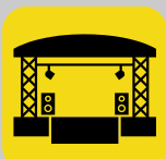
FESTIVAL & STAGE