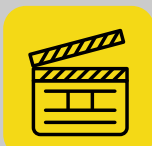
TV & FILM