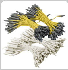
SC-6640Y / SC-6640W