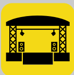
FESTIVAL & STAGE