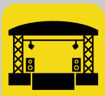
FESTIVAL & STAGE