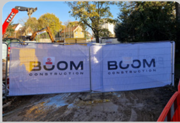
HERES MESH SCRIM