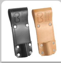
LE-2051B & LE-2051N