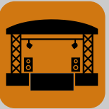
MUSIC & STAGE