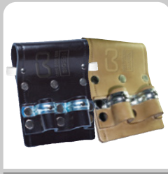
LE-2064BTS & LE-2064N