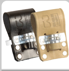
LE-2054BTS & LE-2054N