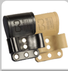
LE-2060B & LE-2060N