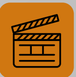
TV & FILM