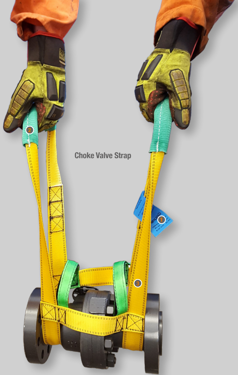
Choke Valve Strap