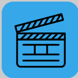
TV & FILM