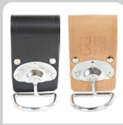
LE-2086B / LE-2086N