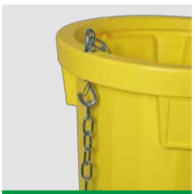
> Coupling system