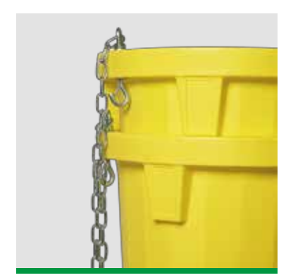
> Anti-joint system