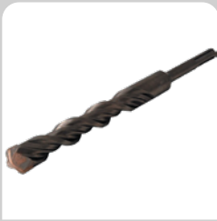
CONCRETE & BRICK (12MM) PT-4758