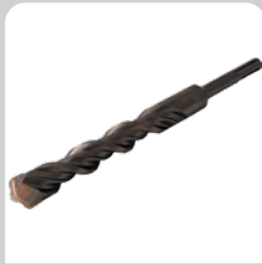
SOFTER MATERIALS (11MM) PT-4757