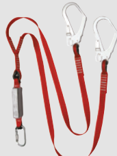
Twin Tailed Webbing FP-4492