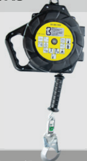
10m to 15m FP-4511