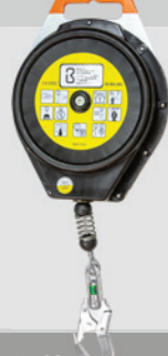
20m to 28m FP-4516