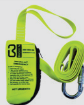
Suspension Trauma Strap FP-3652