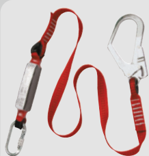
Single Webbing FP-4491