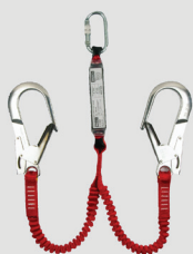
Twin Tailed Elasticated FP-4496