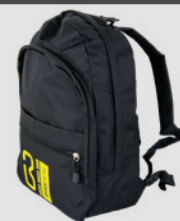
Harness Backpack FP-4483