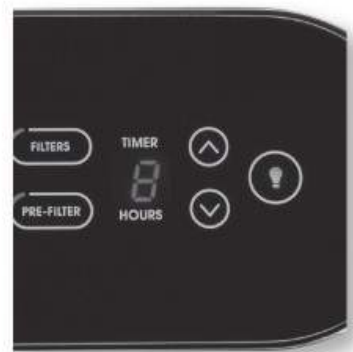
Fig. 5 Timer Function