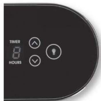
Fig. 6 Dimmer Function

NOTE: The Power (symbol) and the Bluetooth (symbol) icon will always remain illuminated.