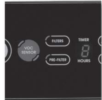
Fig. 9 Will illuminate when it is time to change HEPA filters

You should periodically check these filters. Depending on operating conditions, the True-HEPA filters should be replaced every 12 months, and the Odor Reducing Pre-Filters every 3 months, especially if there have been heavy odors and particles in the home.