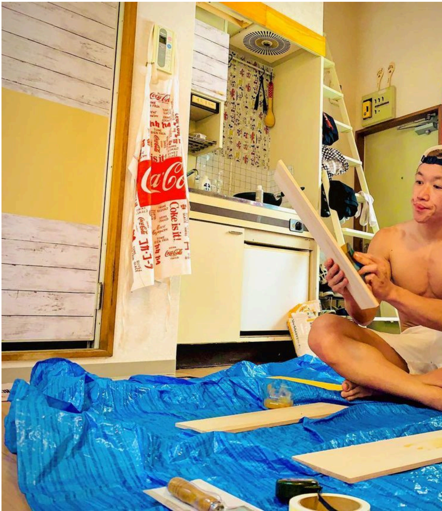
As a family physician with 24 years of natural bodybuilding **I support an environment that DOES