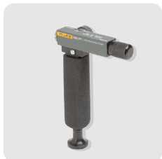
Low Pressure Hand Pump (Model : 700LTP-1)