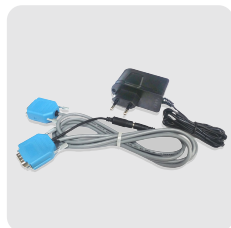
RS232C + Power Adaptor (RS232 Only)