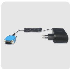
External Power Adaptor