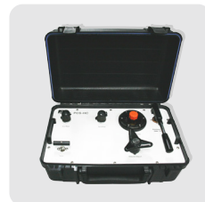
Portable Hydraulic Pressure Generator / controller (Model : PCS-HC)