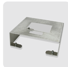
Panel Mounted Bracket