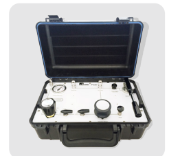
Portable Pneumatic Pressure Generator / controller (Model : PCS-PC)