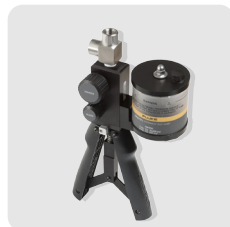
Hydraulic Hand Pump (Model : 700HTP-2)