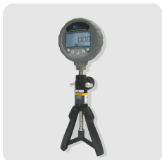
Pneumatic Hand Pump (Model : 700PTP-1)