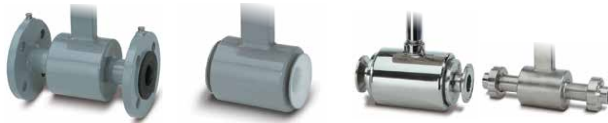
DETECTOR TYPE II