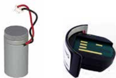
GEN 2 BATTERY GEN 1 BATTERY