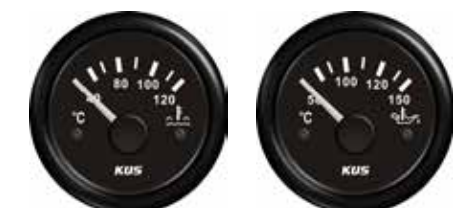
52mm TEMP. GAUGE