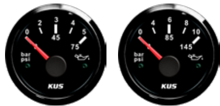
52mm OIL PRESSURE GAUGE