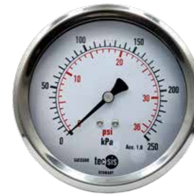
P1777 tecsis 100mm REAR-ENTRY