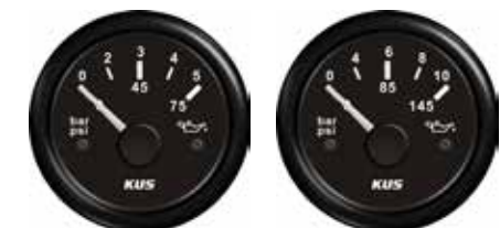
52mm OIL PRESSURE GAUGE