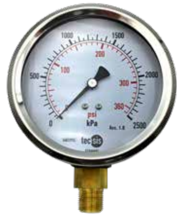
P1776 tecsis 100mm BOTTOM-ENTRY