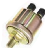
ABOVE-EARTH PRESSURE SENDER