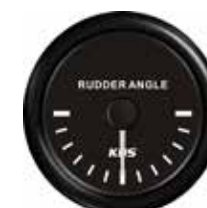
52mm RUDDER ANGLE INDICATOR