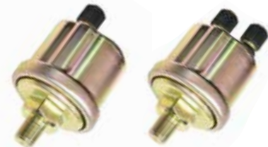
EARTHED PRESSURE SENDER