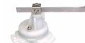
RUDDER ANGLE SENDER