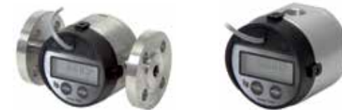
IOG STAINLESS STEEL FLANGE