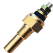
EARTHED TEMP. SENDER