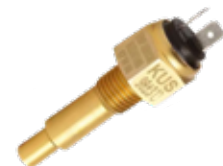
ABOVE-EARTH TEMP. SENDER