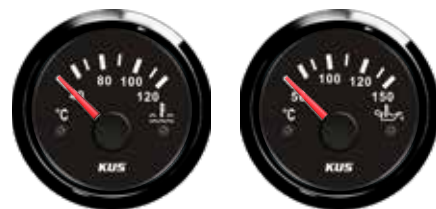
52mm TEMP. GAUGE