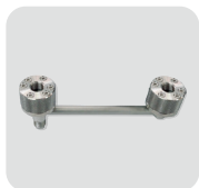
External pressure manifold