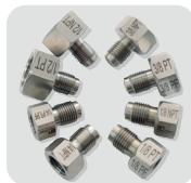
Quick adaptor 1 (1/8", 1/4", 3/8", 1/2" PT/PF & NPT Female set)