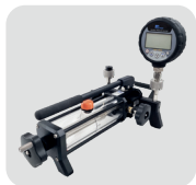
Digital pressure gauge PDR1000 0.025% PDR500 0.1% PDR250 0.25%