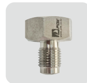
Quick adaptor 3 High pressure 9/16" UNF F Cone Threaded