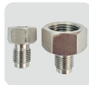
Quick adaptor 2 M14 x 1.5, M20 x 1.5 Female Metric set 2 ea