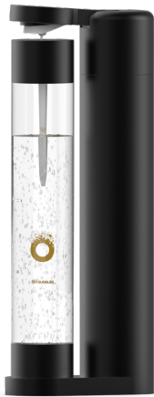
SPARKLING DRINK MAKER

Height: 415 mm Length: 162 mm Depth: 80 mm Weight: 0.7 KG