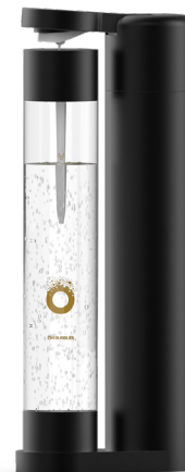
Sparkling drink maker