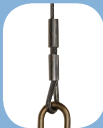
Twin Ferrules with Steel Thimbles