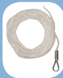
SRL Tag Line Prevents free-wheeling and lock-up