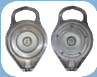
CNC Machined Aluminum Housing