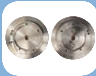
CNC Machined Aluminum Drum