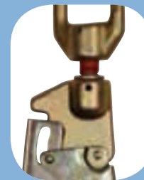
Load-Indicating Snap Hook