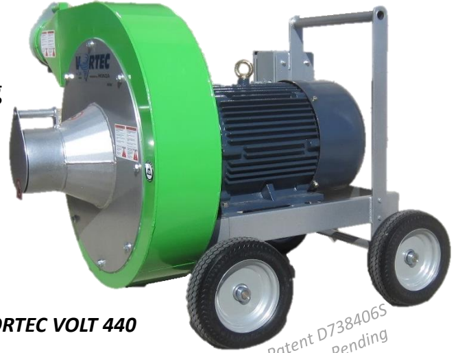
VORTEC VOLT 440

Best used in a commercial building where heavy duty air movement is required.