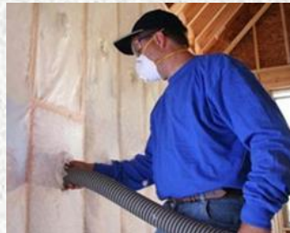
Blow Behind Netting