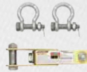
622205T Optional Tension Indicator