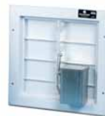
Motorized PVC Shutters 'MIT' Models