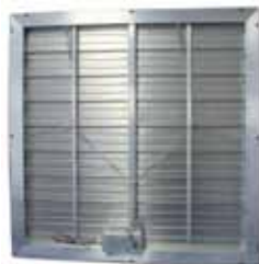
Aluminum Shutters 'WS' Models Shown with Optional SHUTTERMOTOR-SM Motor and Hardware Kit

Schaefer's Aluminum Shutters restrict airflow to a single direction and are used as building air inlets, to feed Schaefer exhaust fans, or on exhaust fans to prevent air entry when the fan is not operating. Aluminum shutters are built tough for long life in the most demanding environments, all at an affordable price.