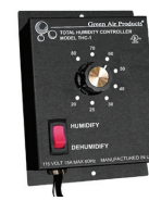
THC-1 Humidity Controller