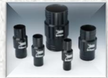
Swivel hose connectors & hose kits