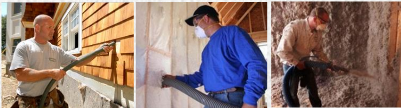
Kits for Dense Pack, Blow Behind Netting, and Spray-on