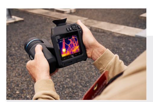
IMPROVE WORKFLOW EFFICIENCIES Collect and manage critical data quickly and easily