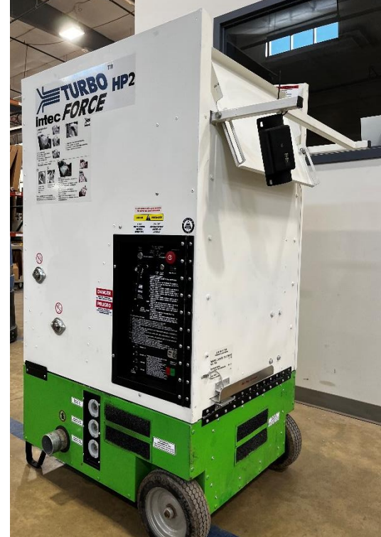
Actual CPO system

Intec Quick-Access<sup>TM</sup> - IQ<sub>A</sub><sup>TM</sup> We've made it easy to make machine adjustments, perform routine maintenance,