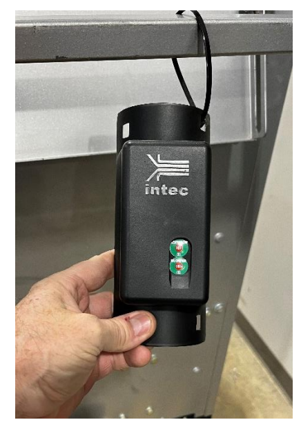
Long Range Transmission Wireless Controls Standard