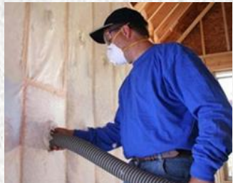
Blow Behind Netting