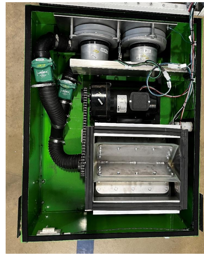
New motors & 1 way valves