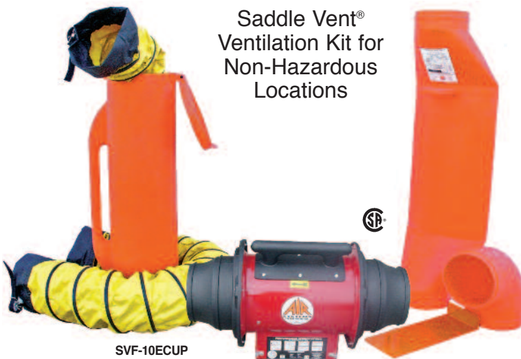
Saddle Vent® Ventilation Kit for Non-Hazardous Locations