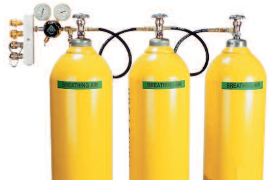
CBA3-346NB Cylinders Not Included

Additional Breathing Air Assemblies Available. Contact Our Customer Service Department.