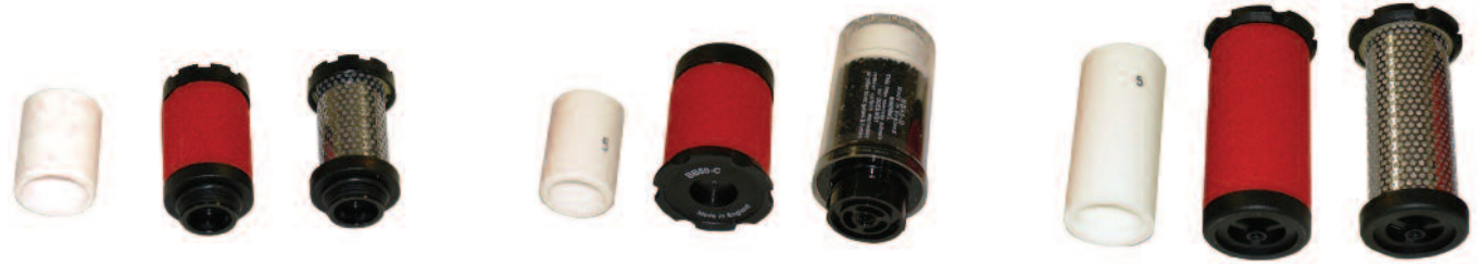
BB30 Series Filters