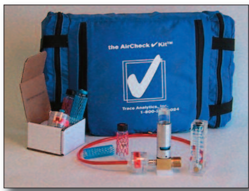
ACK-97 & AQT-1LS