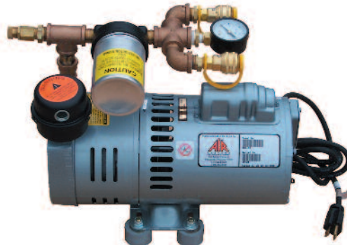
BAC-10 2-WORKER AIR PUMP

Ambient air pumps are not designed for use with pressure demand respirators or Vortex cooling tubes due to low output pressure.