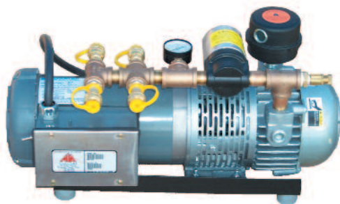
BAC-20 4-WORKER AIR PUMP