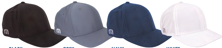
BLACK GREY NAVY WHITE