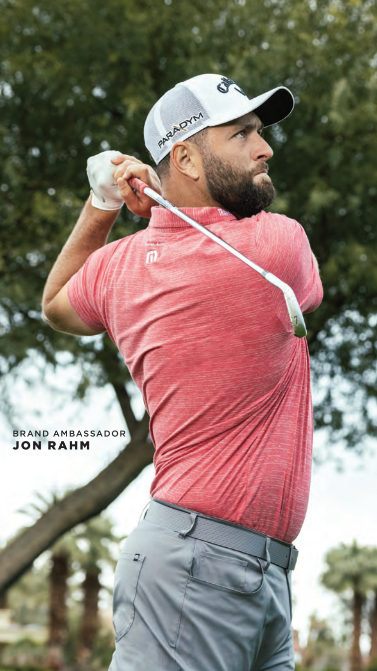
BRAND AMBASSADOR JON RAHM