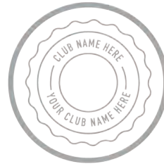
QUIET SHADE PATCH