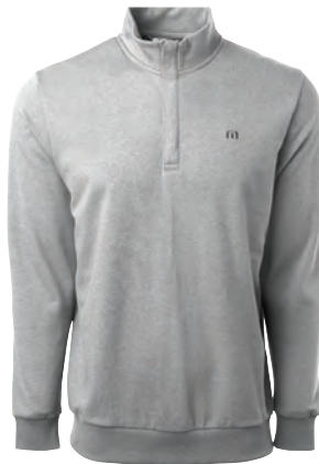
HEATHER LIGHT GREY