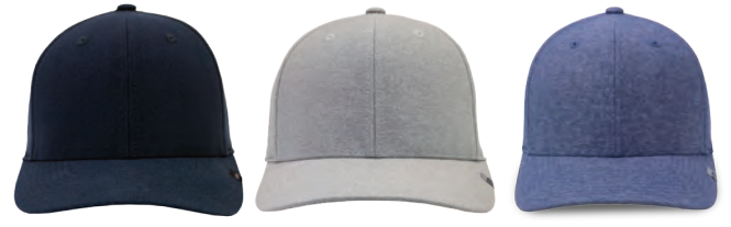
BLACK HEATHER QUIET SHADE HEATHER BLUE