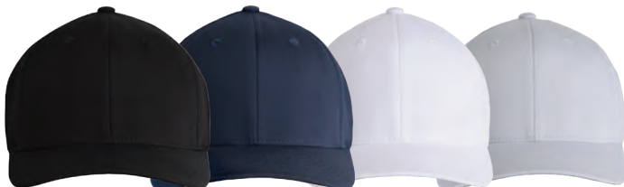
BLACK NAVY WHITE HEATHER GREY