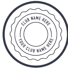
BLUE NIGHTS PATCH