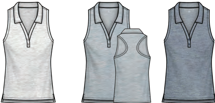
HEATHER LIGHT GREY

70% POLYESTER/22% COTTON/8% ELASTANE / XS-XL