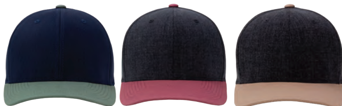
BLUE NIGHTS/ LAUREL HEATHER DARK GREY/ROAN ROUGE HEATHER BLACK/ PORTABELLA