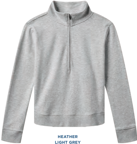
HEATHER LIGHT GREY

49% COTTON/47% POLYESTER/4% SPANDEX / XS-XL