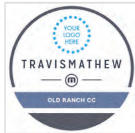
BLUE NIGHTS PATCH