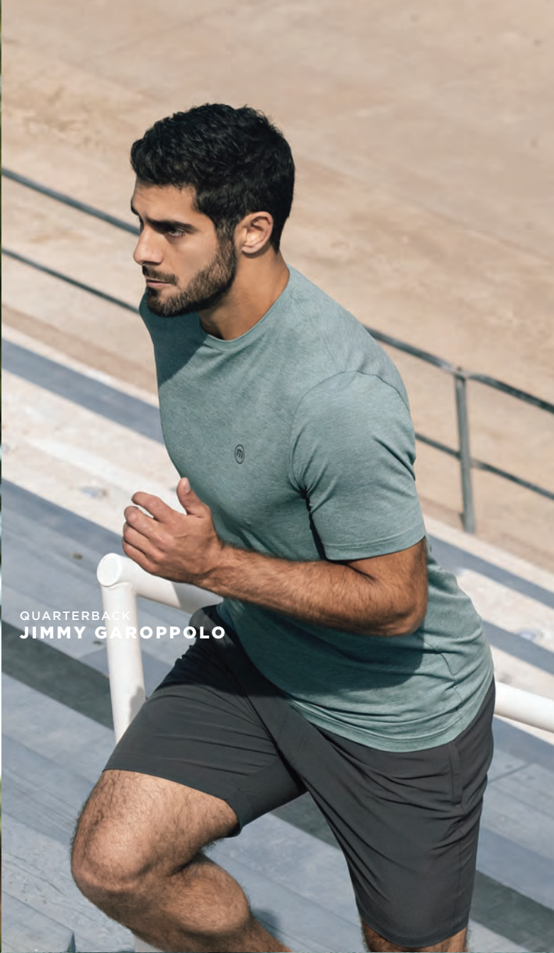
QUARTERBACK JIMMY GAROPPOLO