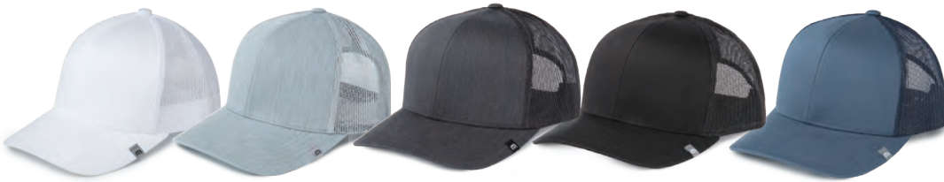
WHITE HEATHER GREY HEATHER GREY PINSTRIPE BLACK DARK BLUE

150 PIECE MINIMUM PER PATCH DESIGN/COLOUR MAY BE PAIRED WITH ONE OR MORE STYLES/COLOURS