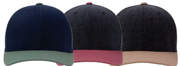
BLUE NIGHTS/ LAUREL