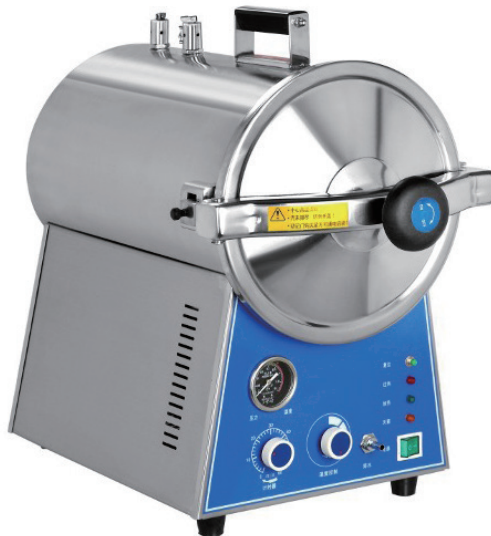
Table Top Pressure Steam Autoclave TS-B