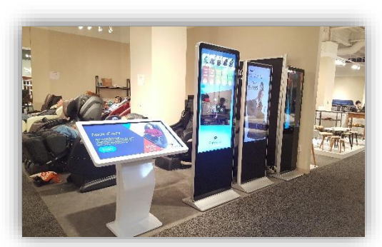
Las Vegas Furniture Show