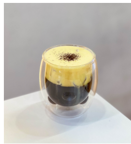
Iced Egg Coffee $ 7.5