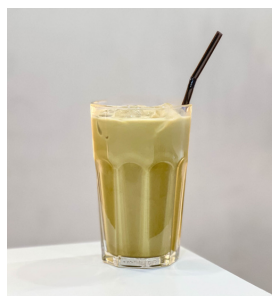
Iced Hojicha Latte $ 6.5