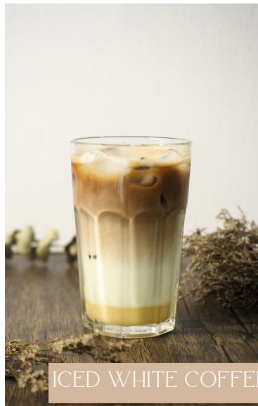
ICED WHITE COFFEE