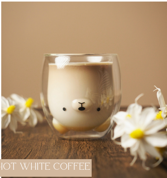
HOT WHITE COFFEE