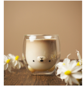
Hot White Coffee $ 6.5