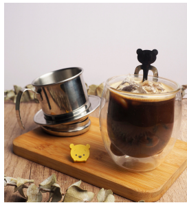
Iced Drip Coffee $ 6.5