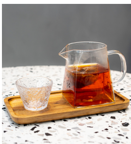
Tea set $ 8.5