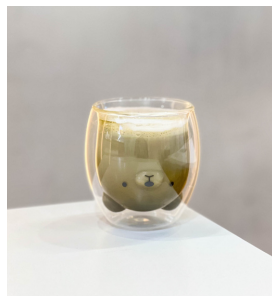
Hot Hojicha Latte $ 5.5