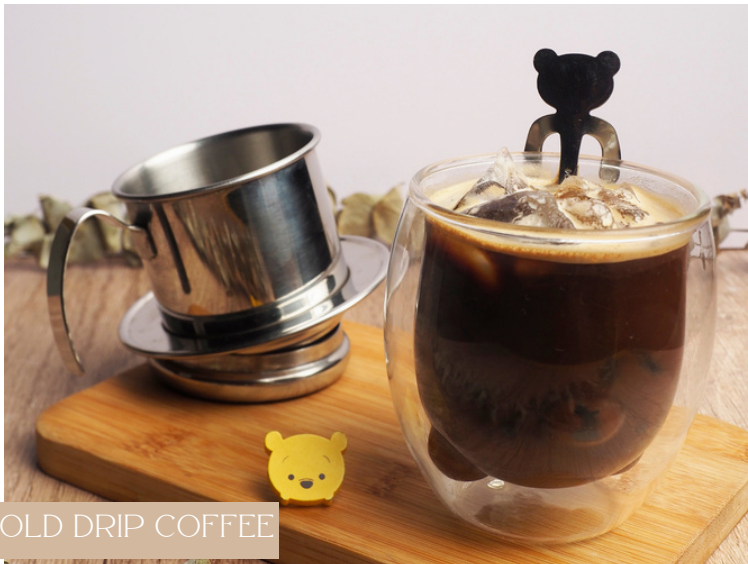
COLD DRIP COFFEE

This coffee has a nutty, fragrant, and addictively robust flavour. It offers a thick mouthfeel and ends on a beautiful note of a subtle chocolate after-taste