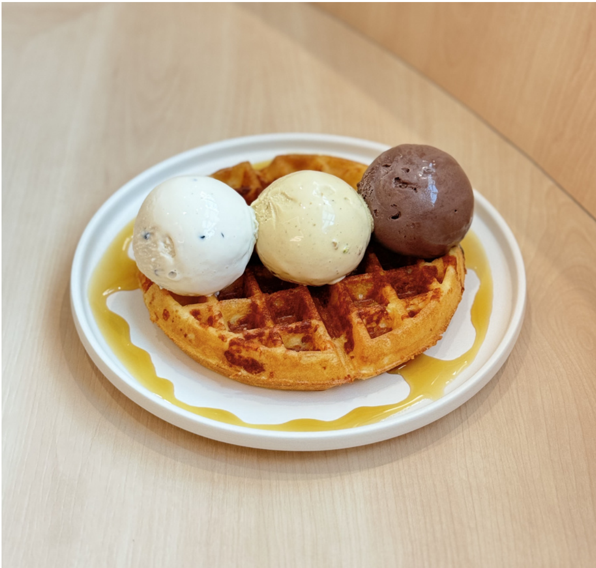
SIGNATURE TRUFFLE CHEESE WAFFLE

Thank you for dropping by our little happy place and we hope the food and memories here can cheer up your day - because seeing you happy means a lot to us.