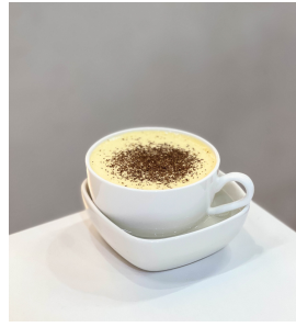
Hot Egg Coffee $ 6.5