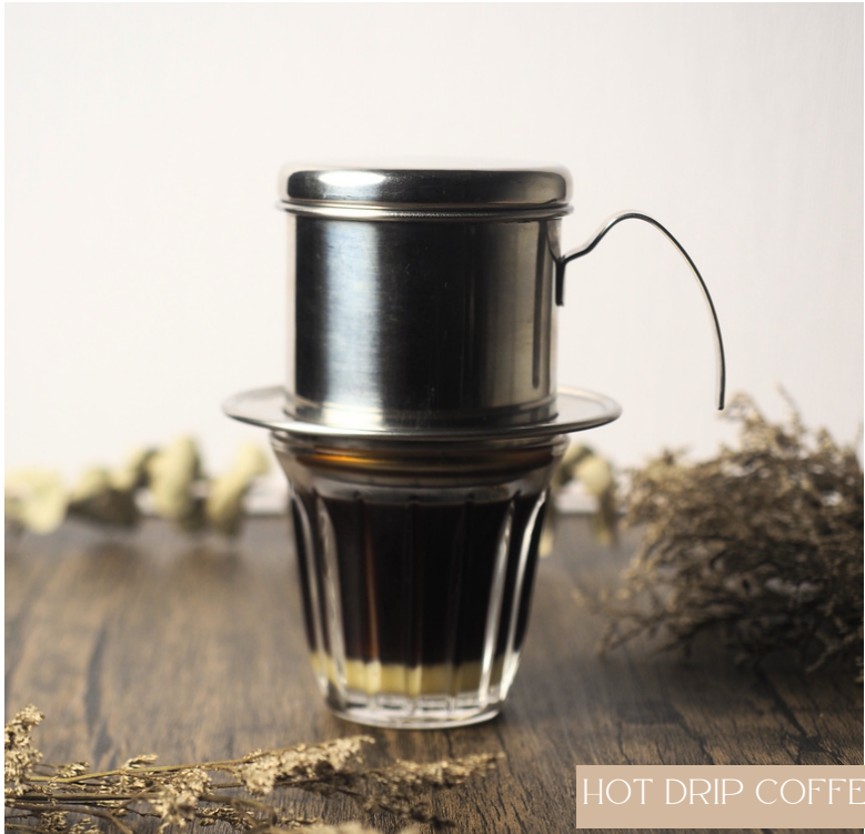
HOT DRIP COFFEE