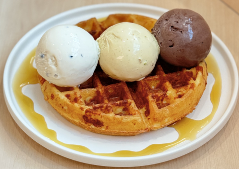
TRUFFLE CHEESE WAFFLE