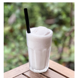
Coconut Float $ 7.5