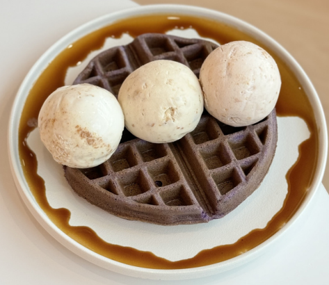
UBE COCONUT MOCHI WAFFLE