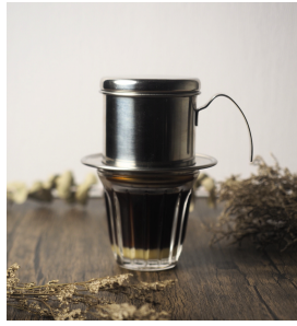
Hot Drip Coffee $ 5.5