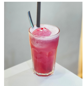
Piglet Float $ 6.5