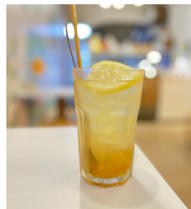
Hot Hunny Yuzu $ 6.5