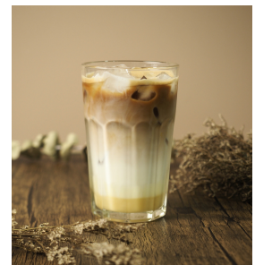
Iced White Coffee $ 7.5