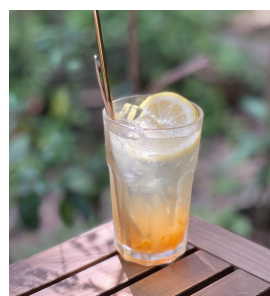
Iced Hunny Yuzu $ 7.5