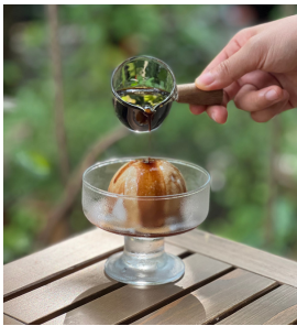
Coco Affogato $ 8.5