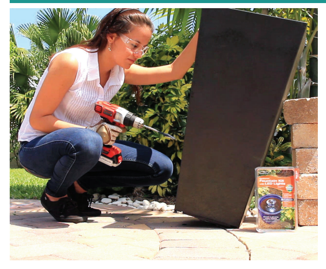
Step 1: Drill a hole on the bottom of the planter using the 1-1/4 in drill bit.

TIP! Wear safety glasses when operating an electric tool.