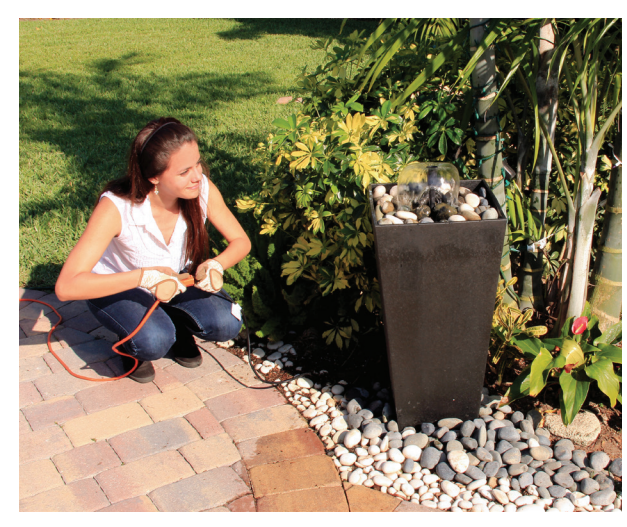
Step 6: Add pebbles and fill with water. Once the pump is fully submerged, plug it in and enjoy!