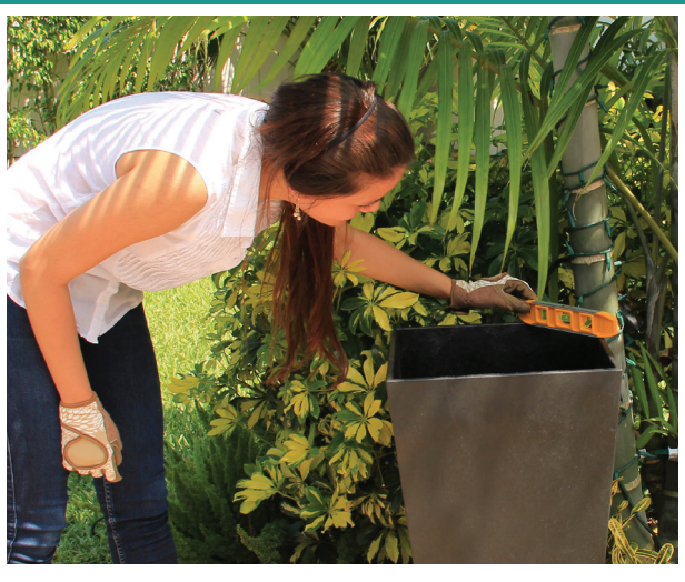
Step 2: Position the planter and make sure it is level.