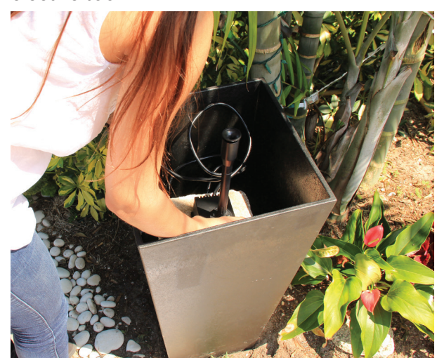
Step 4: Assemble the Container Fountain Kit with Light and place it on the pavers. Run the cord down the planter and out the hole in the back.

TIP! Wear safety glasses when operating an electric tool.