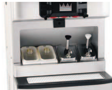
Integrated Syrup Rail Option - 2 room temperature with lids & ladles, 2 heated with syrup pumps

During long no-use periods, the standby feature maintains safe product temperatures in the mix hopper and freezing cylinder.