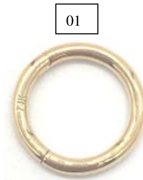
Image of test sample

Test Procedure: The sample was determined in compliance with the method GB/T28016 and XRF screening