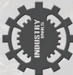
Opaque Grey 70%