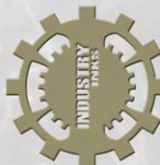
French Grey 50%