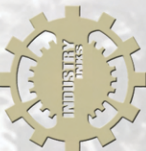
French Grey 30%