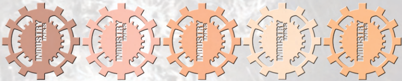
All Mighty Mid