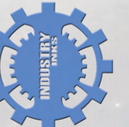
Blue Violet Lake