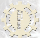
French Grey 10%