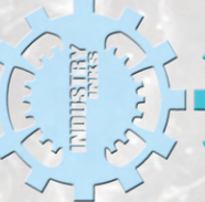
Sky Blue Light