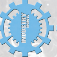
Non Photo Blue