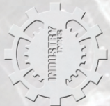
Opaque Grey 10%