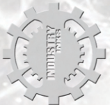
Opaque Grey 20%