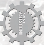
Opaque Grey 30%