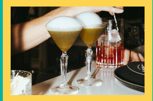
BOMBONIERE FROM $10.95