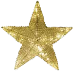
(1) 36" LED Crystal Star