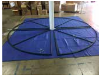
(8) Bottom Ring Sections