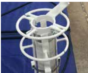
(1) Top Ring 15"x 30"