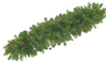
(5) 10' Sections of 14" Mountain Pine Garland - unlit