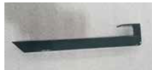
(16) 2"x24" Metal Stakes