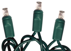
(Multicolor or Warm White)