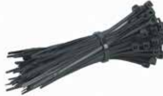
(200) 7" Clear Cable Ties