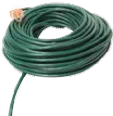
(1) 50' 16/3 Green Extension Cord