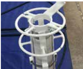
(1) Top Ring 15"x 30"