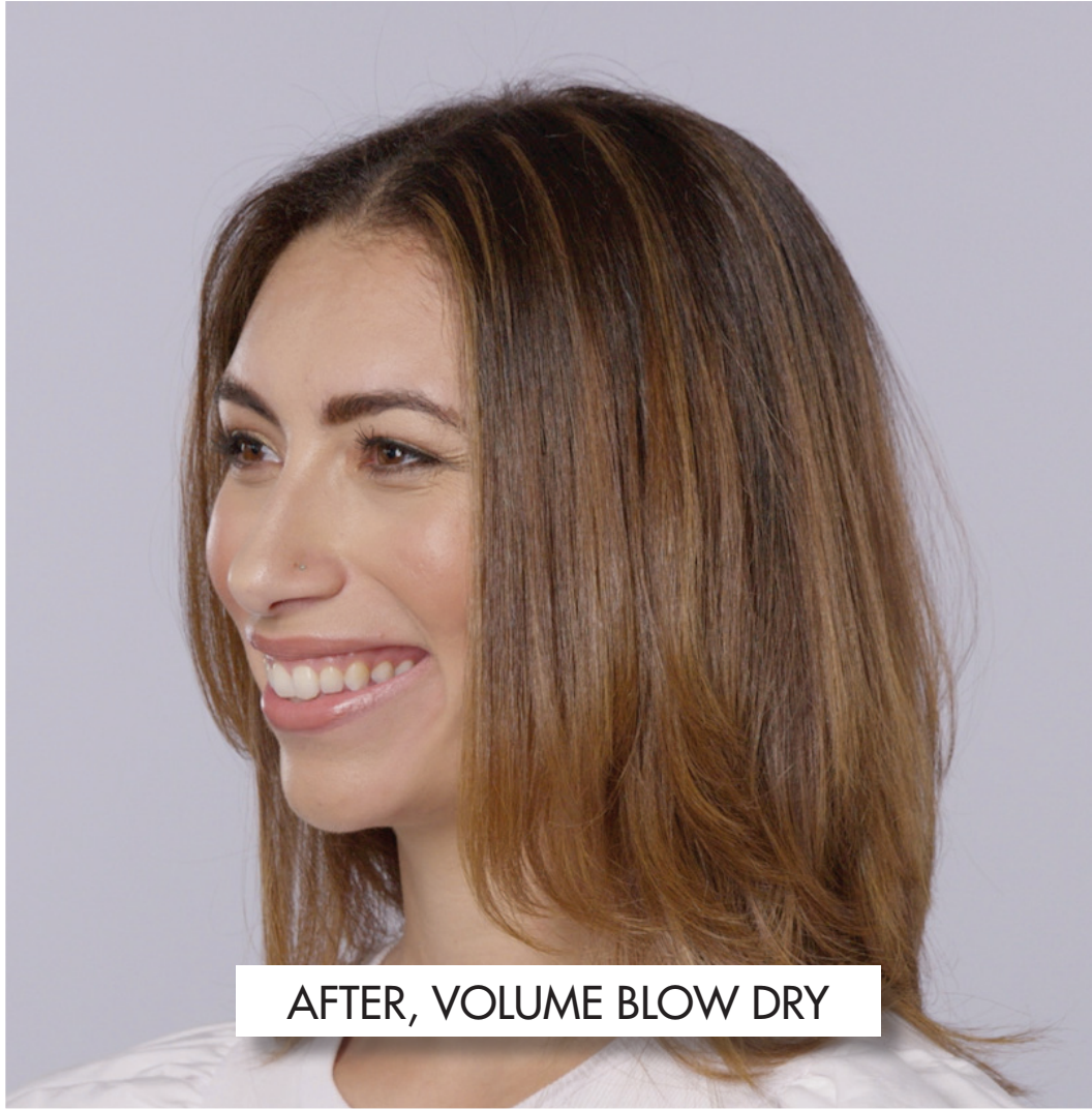
AFTER, VOLUME BLOW DRY