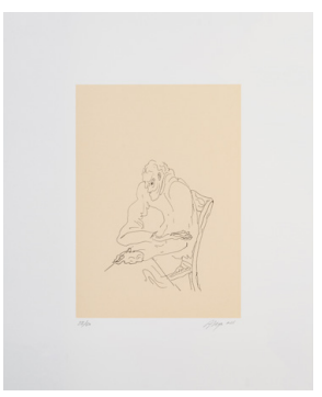
DESENHO 39 x 48 cm

RAPTO ( The Abduction of Hippodamia ), inspired on Greek mythology, describes the kidnapping of the bride Hippodamia during her wedding by the centaur Eurytus, resulting in a battle between humans and centaurs.