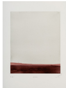
STRATA 30 x 40 cm