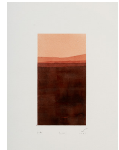
HUMUS 30 x 40 cm