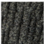
Dark Grey / Bark Pattern