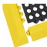
Optional Yellow Edging