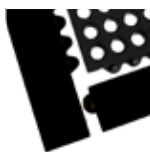
Optional Black Edging